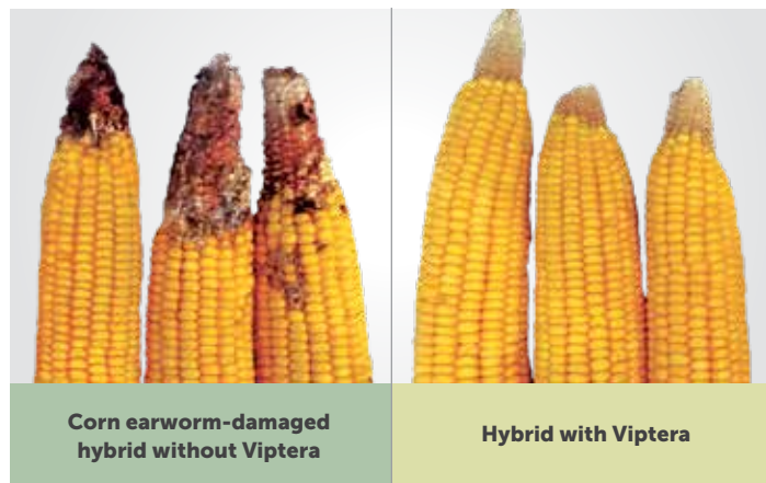
Columbia, MO, 2015

Trait stacks with above-ground insect control: