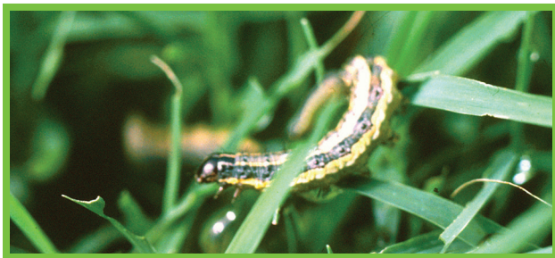
Armyworm caterpillar.