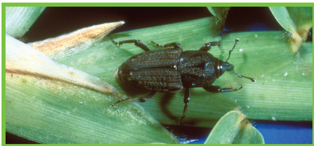
Adult billbug.