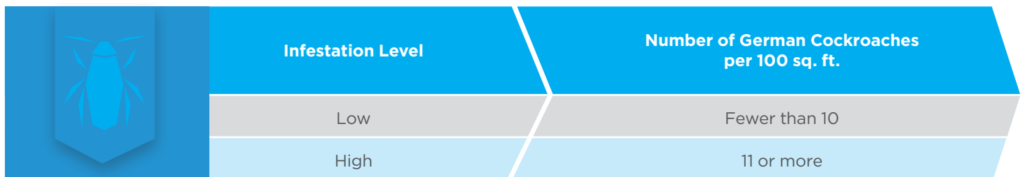
Table 1 - Visually Estimate a Cockroach Infestation